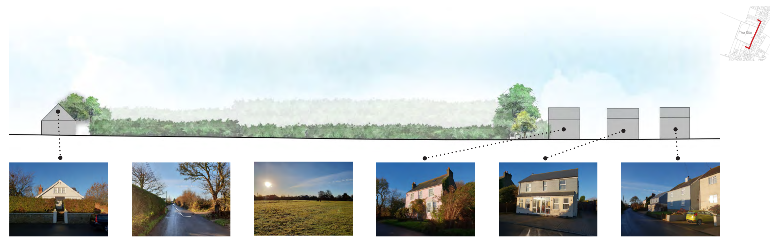
Existing Site Sections